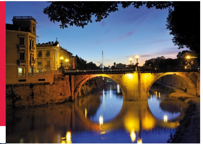
Old Bridge-Bridge of Dangers

and splendid spaces. The railway came into operation and the construction of the Puente Nuevo was begun. But another flood struck - the Santa Teresa flood of the fifteenth of October, 1879 - causing more than eight hundred deaths and sowing panic in the city and surrounding farmland.